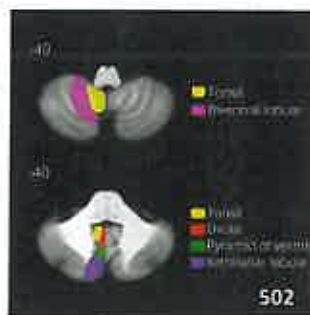
Select figures listed on the Table of Contents only appear within the full-length articles online.