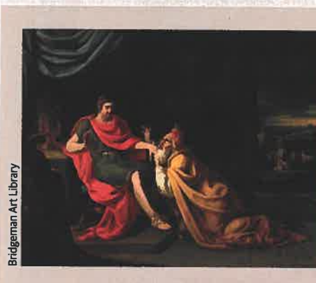
Bridgeman Art Library