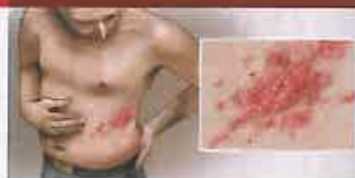
JAMA Patient Page 416 Shingles Vaccination

Coagulation factor Xa (recombinant), inactivated-zhzo binds to the factor Xa inhibitors apixaban and rivaroxaban to reverse their anticoagulant effect. This Medical Letter on Drugs and Therapeutics discusses the efficacy and safety of andexanet alfa for patients treated with factor Xa inhibitors who have active major bleeding.