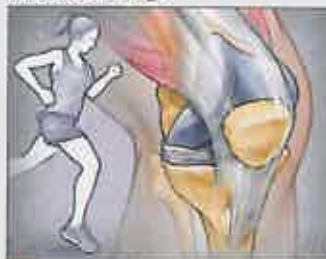
418 Patellofemoral Pain