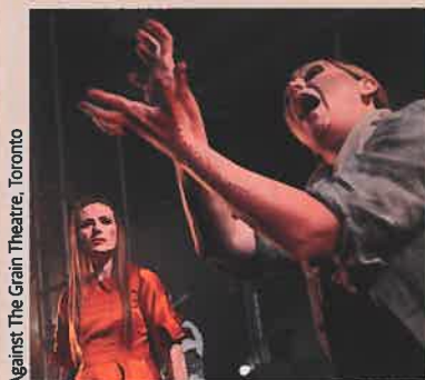
Against The Grain Theatre, Toronto