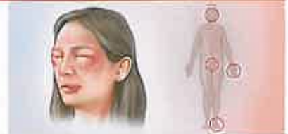
JAMA Patient Page 2054 Angioedema

Abuse-deterrent opioids are designed to be more difficult, less attractive, or less rewarding to use for nontherapeutic purposes. This Medical Letter on Drugs and Therapeutics discusses the testing and marketing of opioids formulated to deter abuse.