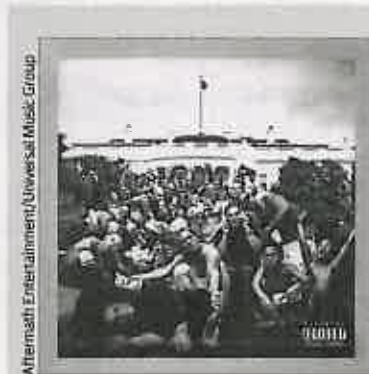
Aftermath Entertainment/Universal Music Group