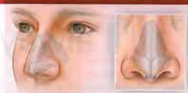
JAMA Patient Page 1406 Rhinoplasty