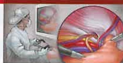
JAMA Patient Page